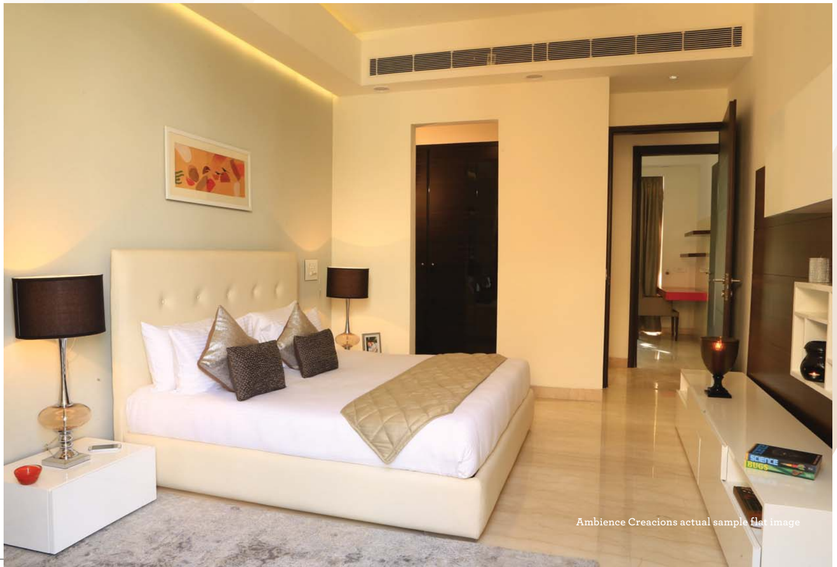
Ambience Creacions actual sample flat image