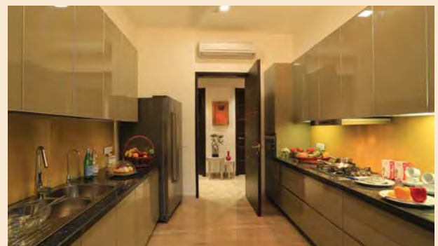
Ambience Creacions actual sample flat image